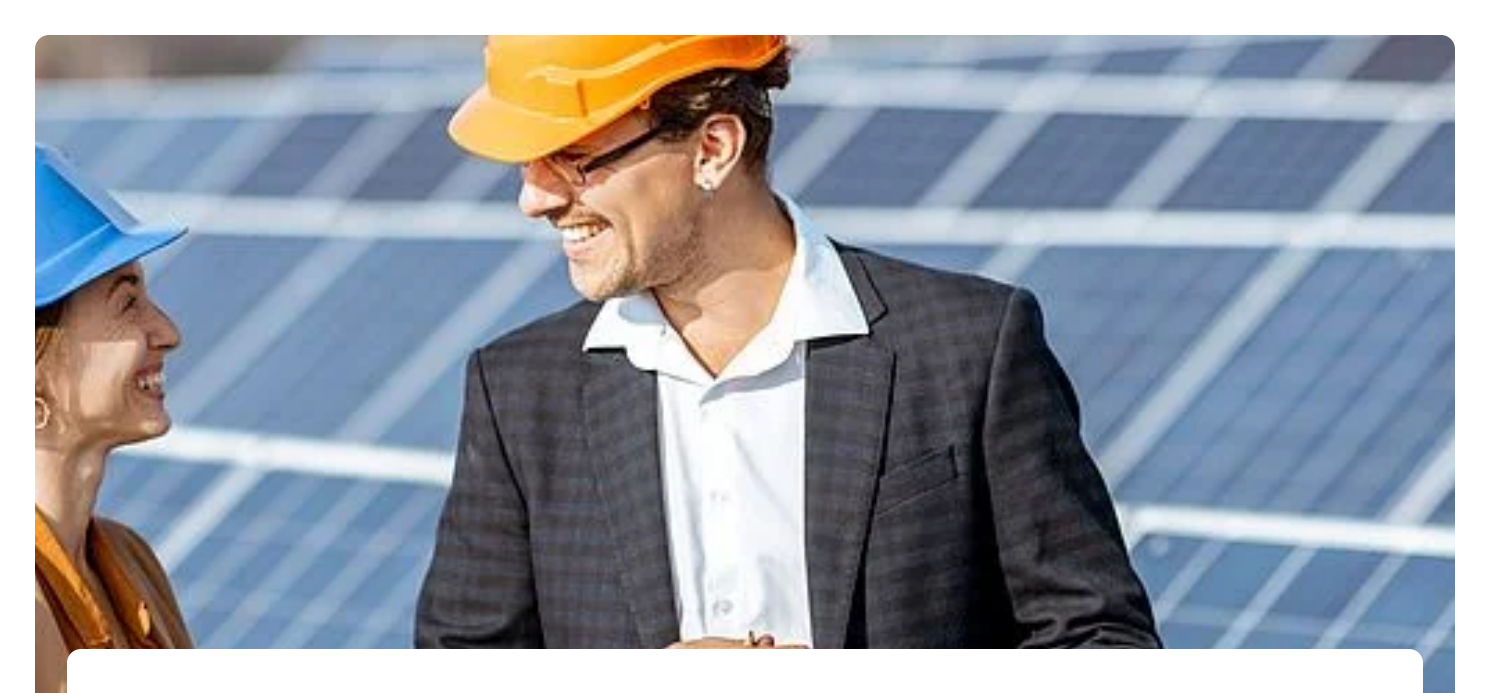
Working in Germany: the official website for qualified professionals